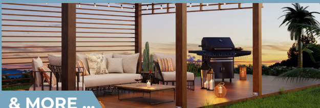
& MORE ...