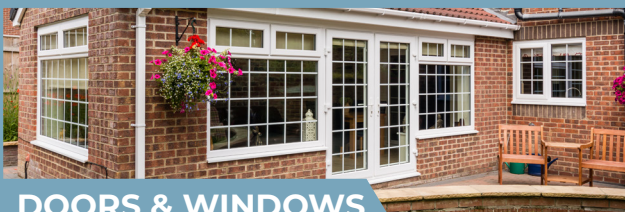
DOORS & WINDOWS